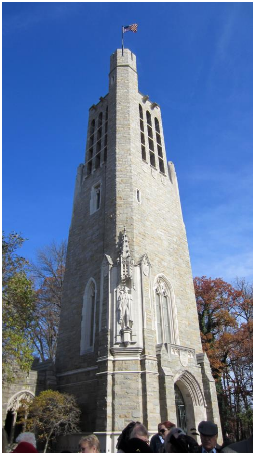
Attendees assemble before the Carrillion Tower at Washington Memorial Chapel on November 9, 2014.

Each year, Weekly State Prayers are held at the George Washington Memorial Chapel in Valley Forge, Pennsylvania to remind us of the freedoms which we enjoy in America. Each sovereign state is honored over the course of the calendar year. Virginia Day for 2014 was Sunday, November 9th.